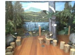
Environment Discovery Centre