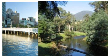
Melbourne Water Yarra River

We are located in the iconic Waterwheel Building in the historic township of Warburton , 72 km east of Melbourne. It is the furthestmost township along the Yarra River , lies down stream of the Upper Yarra Reservoir and is surrounded by a variety of unique ecosystems and conservation significant natural environments. With an abundance of native flora and fauna, the Yarra Ranges National Park and the Yarra State Forest offer richly diverse ecosystems for research and education. Home to the endangered Victorian bird and animal emblems, the Warburton Valley is the perfect place for our education programs and Environment Discovery Centre!