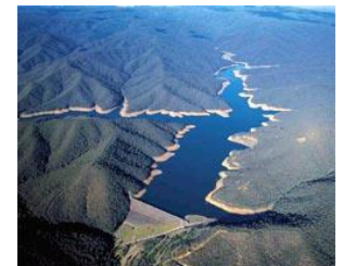
Melbourne Water - Upper Yarra Reservoir

Our Education Modules are specific topic information resources that can be incorporate into current programs to assist in meeting the specific needs of each school and year level. We aim to support classroom objectives and provide relevant program content.