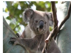
Koala - Phascolarctos cinereus

Study one of Victoria's most significant ecological treasures; the Habitat Tree. Get up close to Old Growth Mountain Ash, Manna Gum, Mountain Grey Gum and the Californian Redwood. Observe the characteristics of these incredible giants and discover the wildlife that relies on them for their survival. Learn about the vital role old growth forest ecosystems play in biodiversity, water and wildlife conservation, and to the sustainability and future of all living things on earth. Year 2 – 8