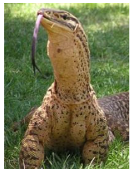
Monitor Lizard - Goanna

Our Education Modules are specific topic information resources that can be incorporate into current programs to assist in meeting the specific needs of each school and year level. We aim to support classroom objectives and provide relevant program content.