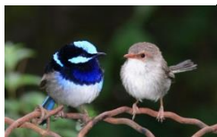
Superb Blue Wren