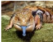
Eastern Blue Tongue