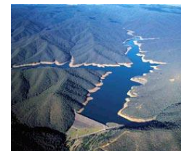
Melbourne Water Upper Yarra Reservoir

unique Eco Tour's that are guided by passionate and experienced environmental educators. Our guides can take you on an exploration into pristine and historical locations