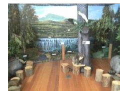
Environment Discovery Centre

Minimum booking 12 persons $5.00 entry Groups >20 $4.00 entry Duration: 50 minutes