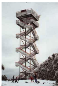
Lookout Tower Mt Donna Buang