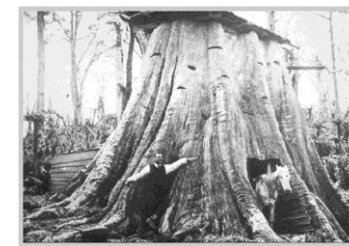
Upper Yarra Museum