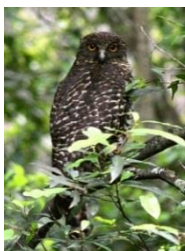
Powerful Owl ( Ninox strenua )