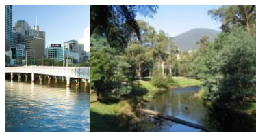
Melbourne Water - Yarra River

Warburton Habitat Tree is located in the iconic Waterwheel Building in the historical township of Warburton , 72 km east of Melbourne. It is the furthestmost township along the Yarra River , lies down stream of the Upper Yarra Reservoir and is surrounded by a variety of unique ecosystems, conservation significant natural environments and heritage listed sites. With, a rich history of early settlement and an abundance of native flora and fauna, the Yarra Ranges National Park and the Yarra State Forest offer richly diverse locations for animal spotting, bird watching, research, education, bush walks and hiking. Our location also offers easy access to walking tracks, the Yarra River, coach parking, cafes and shops!