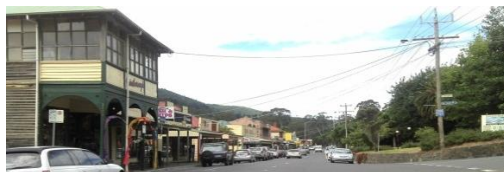
Warburton Vic 3799